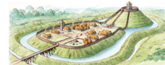
motte and bailey castle

We can compare and contrast different types of castles: