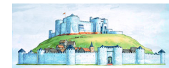
stone keep castle